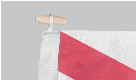
Rope and Toggle