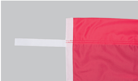
Sleeve and Mastbands