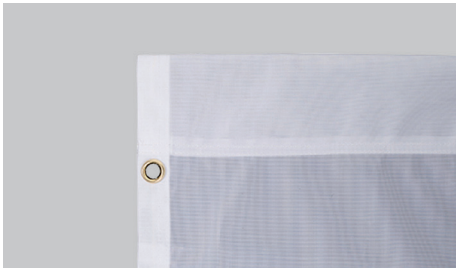
Sleeve and Eyelets