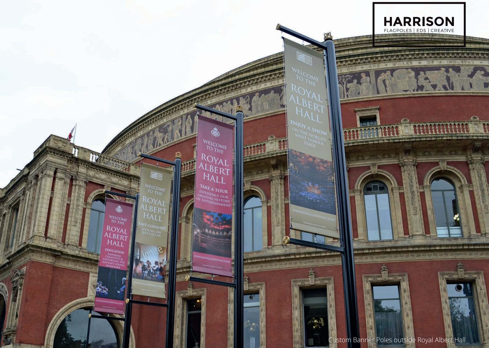
Custom Banner Poles outside Royal Albert Hall