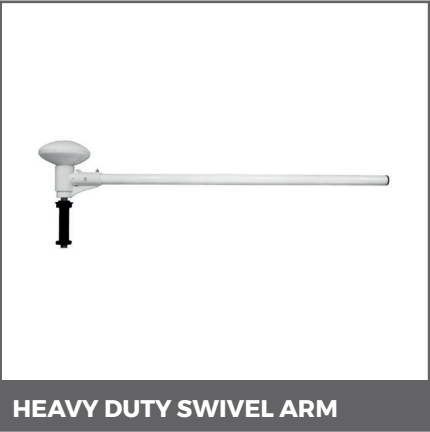
HEAVY DUTY SWIVEL ARM