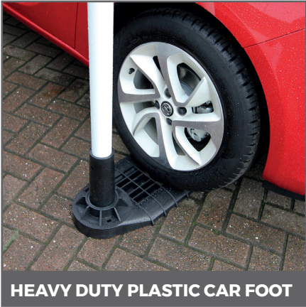
HEAVY DUTY PLASTIC CAR FOOT