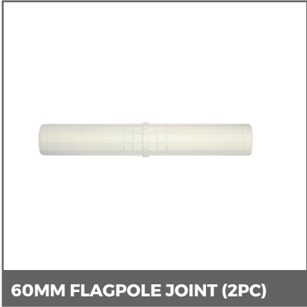
60MM FLAGPOLE JOINT (2PC)