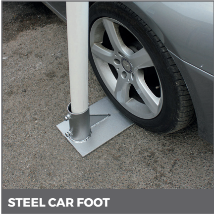
STEEL CAR FOOT