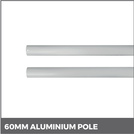
60MM ALUMINIUM POLE